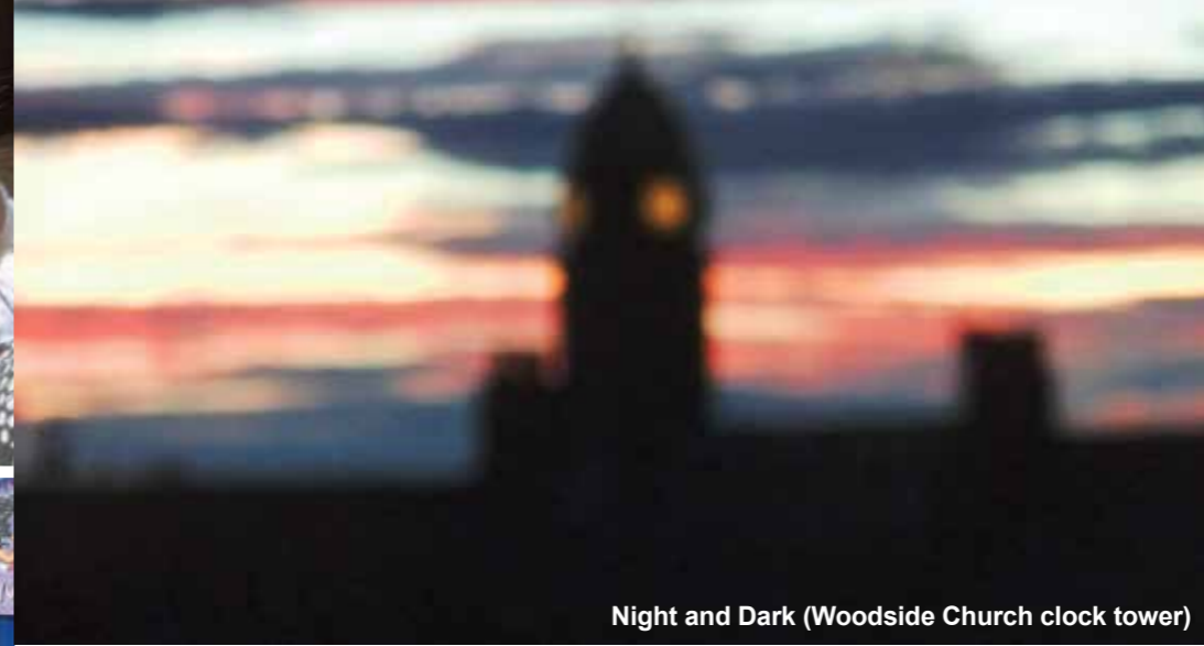
Night and Dark (Woodside Church clock tower)