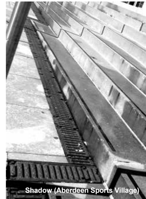
Shadow (Aberdeen Sports Village)