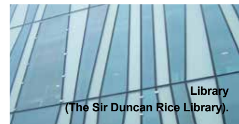
Library (The Sir Duncan Rice Library).