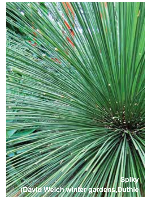
Spiky (David Welch winter gardens, Duthie Park)