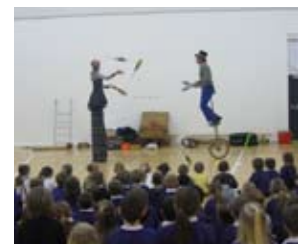
Kake and Kandy