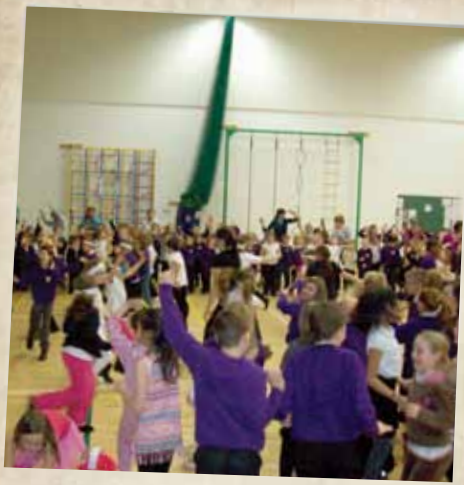
Samba Celebration at Heathryburn 1