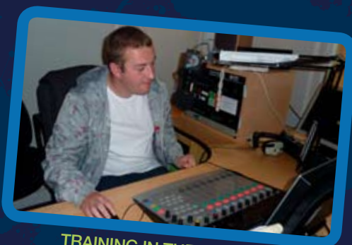
TRAINING IN THE STUDIO

If you are interested in learning more about any of our courses, please call shmu at (01224) 515013 or email us at training@shmu.org.uk or just text the word TRAINING and your name to 60300.