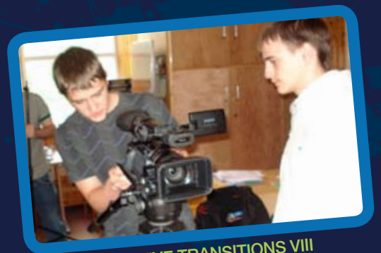
POSITIVE TRANSITIONS VIII

shmuWORKS is a fantastic opportunity for 18-25 year olds who are not in education, employment or training to take part in a 6 week training programme.