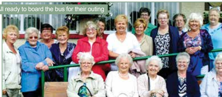
All ready to board the bus for their outing

At the end of the season (which runs April to September) we have a Trophy Lunch for all of our bowling winners, another good time is had by all.