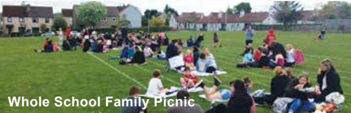
Whole School Family Picnic

In response to Westpark community needs, Northfield after school clubs available were drawn together, promoting, celebrating and encouraging Westpark children to attend. Staff from school, Police Scotland and Active Schools accompanied the children, increasing their confidence to grasp opportunities being made available.