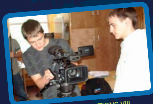
POSITIVE TRANSITIONS VIII

shmuWORKS is a fantastic opportunity for 18-25 year olds who are not in education, employment or training to take part in a 6 week training programme.