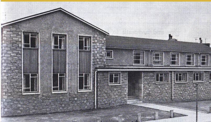
Tillydrone premises 1987-1988