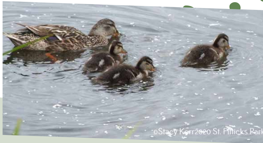
St. Fitticks Park