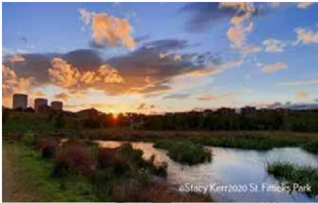
St. Fitticks Park

If nothing else St Fittick's Park is, for many of us, our garden! We would be hard pressed to design a better habitat for Torry's most sensitive and precious wildlife, and to lose such an area would be a tragic loss to our area. I would go so far as to say that St Fittick's Park could well be the most biodiverse wetland habitat in Aberdeen city, and especially given how critical access to nature has been in lockdown – taking Torry's last greenspace away would be a devastating loss to our community. Especially as there is so much potential, both for wildlife and for people, in utilising this glorious area for the community as it exists in its present state.