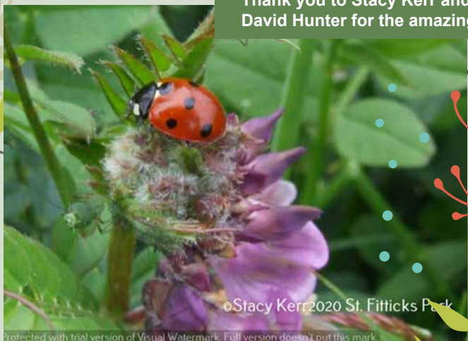
St. Fitticks Park

Protected with trial version of Visual Watermark. Full version doesn't put this mark.