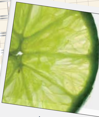
need 5 limes