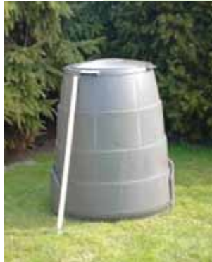
A green Johanna, one of the free composting units available with this scheme.

The average family throws away £430 of food each year and it has