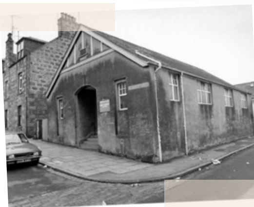
Torry 1980-02-25 Community Centre