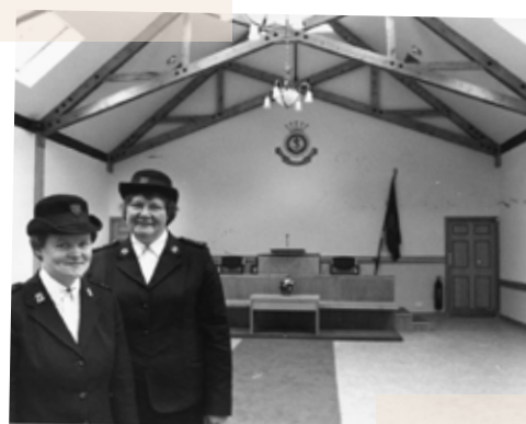
Salvation Army 1991-05-29 Torry Community Centre