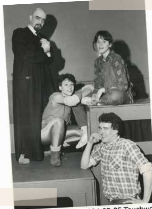
Guizer Theatre Group 1984-02-05 Touchwood

This year is the 90th Anniversary of the OTCC, and you can help us if you have any stories to share and even better if any old photos are still tucked inside a show box in the back of a wardrobe! We would love to hear your stories so please contact us at the Centre.