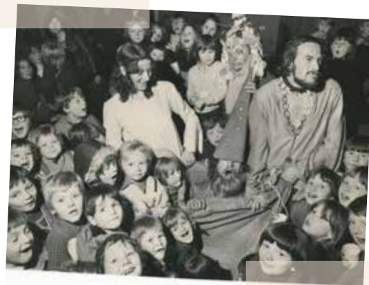
Guizer Theatre Group 1978-01-07 Torry Community